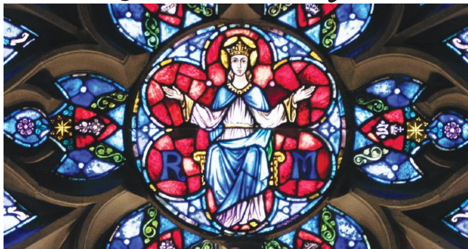
Mary, Queen of Martyrs.