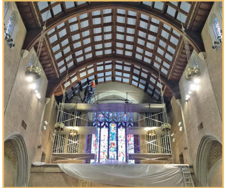
The week of August 31, work began on cleaning the walls in the choir loft.

As our 108-year-old parish prepares to celebrate its Parish Feast Day this month of September, we are calling on our faithful parishioners to honor the memory of those early congregants and imitate their sacrifice—in the face of similar economic challenges—and make a gift or memorial to help us finish our major renovation. The improvements being undertaken today will preserve this beautiful church for future generations.