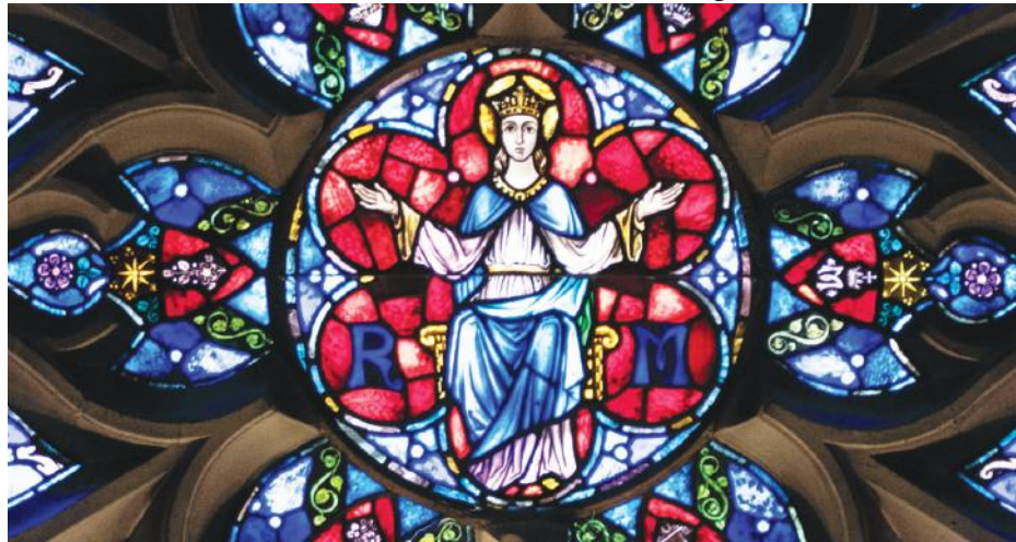
Mary, Queen of Martyrs.