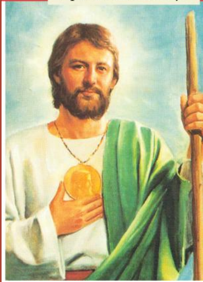
Join in prayer and bring your intentions to St. Jude: for physical, mental, spiritual health