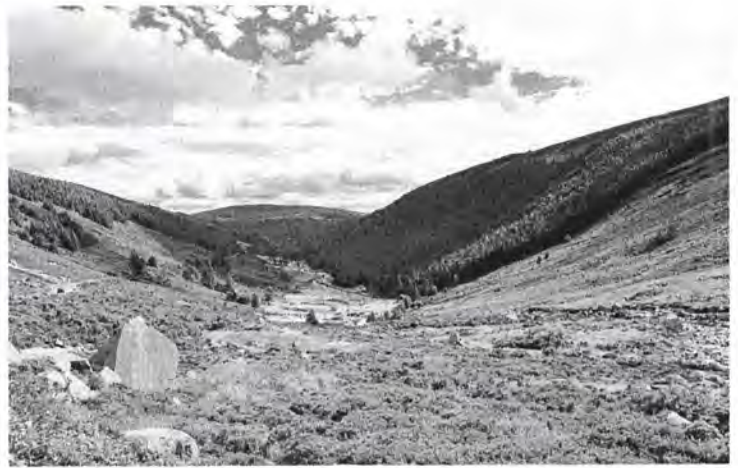
Ring of Kerry

Your tour of Dublin this morning includes a visit of Trinity College to view the famous Book of Kells. Other