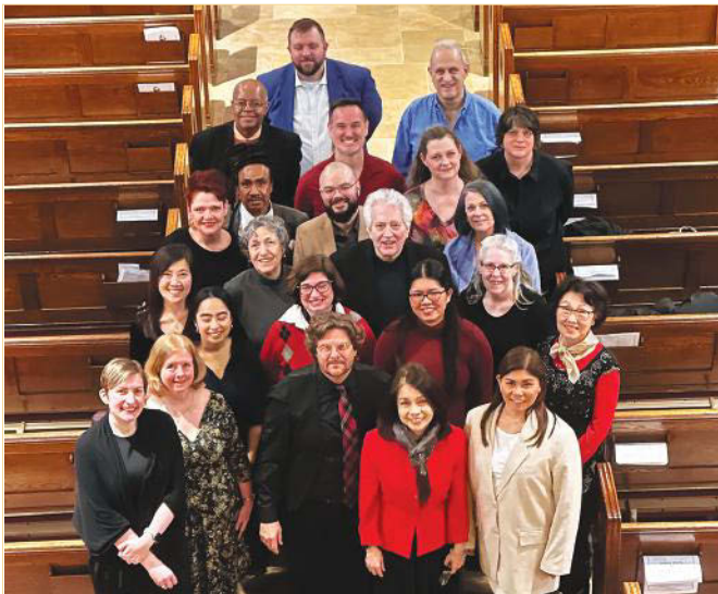
OLQM Choir after Good Friday evening services, March 29, 2024

The drawing will be on Sunday, May 26 after the 1 p.m. Mass. You don't have to be present at the drawing to win. We will announce the winner in the bulletin. Thank you for supporting the Sacred Music Society of Our Lady Queen of Martyrs.