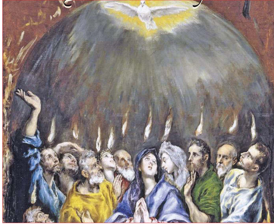
Pentecost El Greco