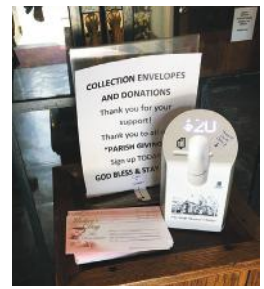
Dip to Donate

We strongly encourage you to use online Parish Giving . You can enroll at our website ourladyqueenofmartyrs.org or from your phone using the QR code here. You can make one-time or recurring donations with Parish Giving and there is telephone support; call 866-307-7140, Mon-Fri, 8:30AM to 4:30PM.