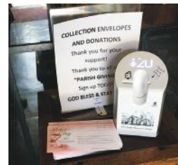
Dip to Donate