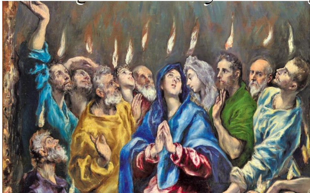
Pentecost El Greco