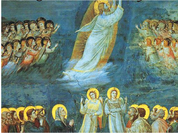
Giotto's Ascension, Scrovegni Chapel, Padua, Italy, ca. 1300