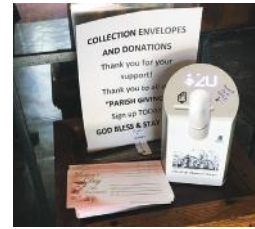
Dip to Donate

We humbly ask you to please keep up your increased support and continue your weekly contributions to provide for your parish.