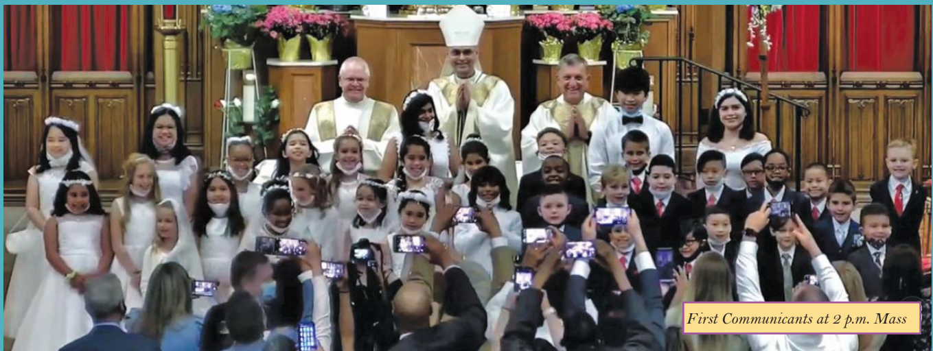
First Communicants at 2 p.m. Mass