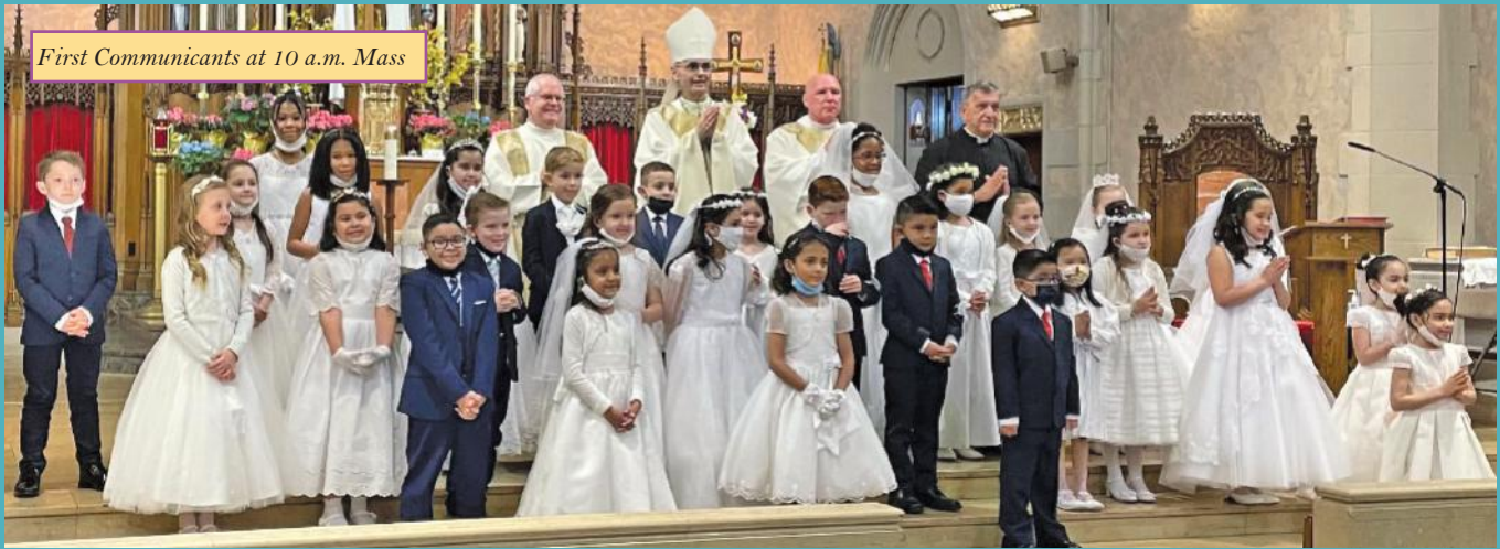
First Communicants at 10 a.m. Mass