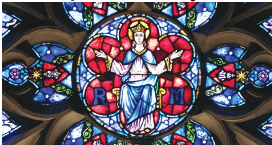
Mary, Queen of Martyrs.