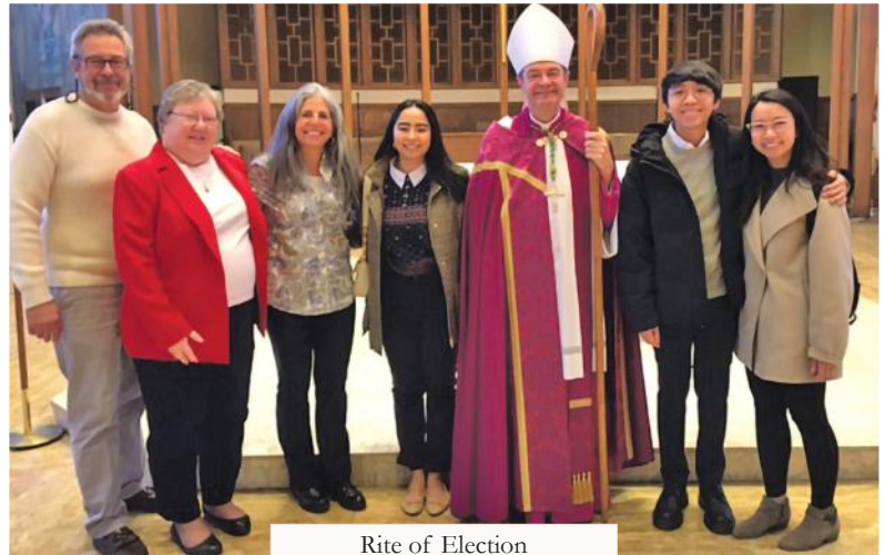
Rite of Election