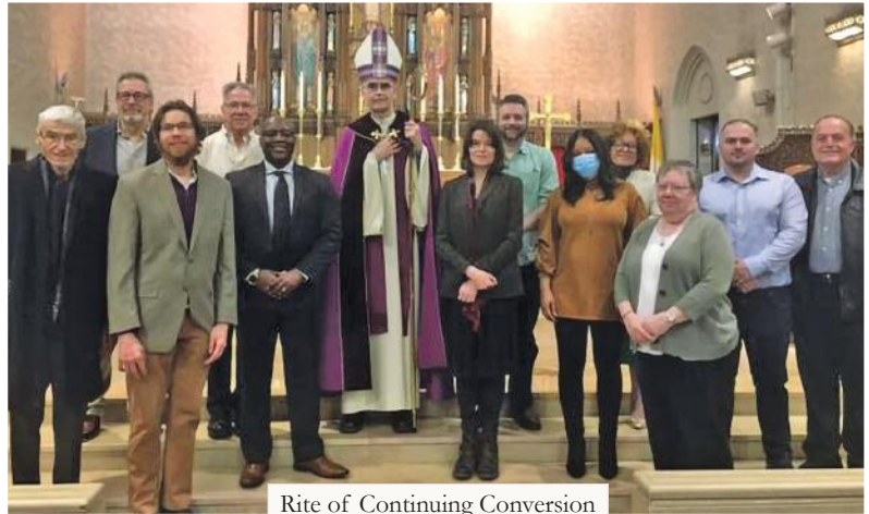
Rite of Continuing Conversion