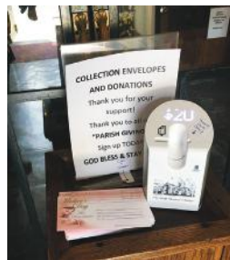
Dip to Donate

We strongly encourage you to use online Parish Giving . You can enroll at our website ourladyqueenofmartyrs.org or from your phone using the QR code here. You can make one-time or recurring donations with Parish Giving and there is telephone support; call 866-307-7140 , Mon-Fri, 8:30AM to 4:30PM.