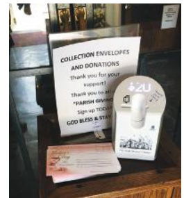
Dip to Donate

We strongly encourage you to use online Parish Giving . You can enroll at our website ourladyqueenofmartyrs.org or from your phone using the QR code here. You can make one-time or recurring donations with Parish Giving and there is telephone support; call 866-307-7140 , Mon-Fri, 8:30AM to 4:30PM.