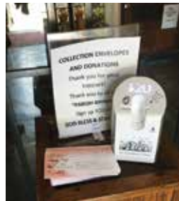
Dip to Donate

We strongly encourage you to use online Parish Giving . You can enroll at our website ourladyqueenofmartyrs.org or from your phone using the QR code here. You can make one-time or recurring donations with Parish Giving and there is telephone support; call 866-307-7140 , Mon-Fri, 8:30AM to 4:30PM.