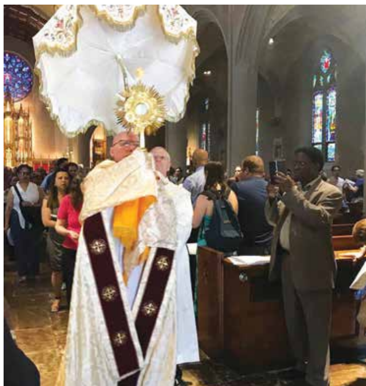
Corpus Christi Procession 2019.

Word made Flesh, the bread of nature By His word to Flesh He turns; Wine into His Blood He changes; What though sense no change discerns? Only be the heart in earnest, Faith her lesson quickly learns.