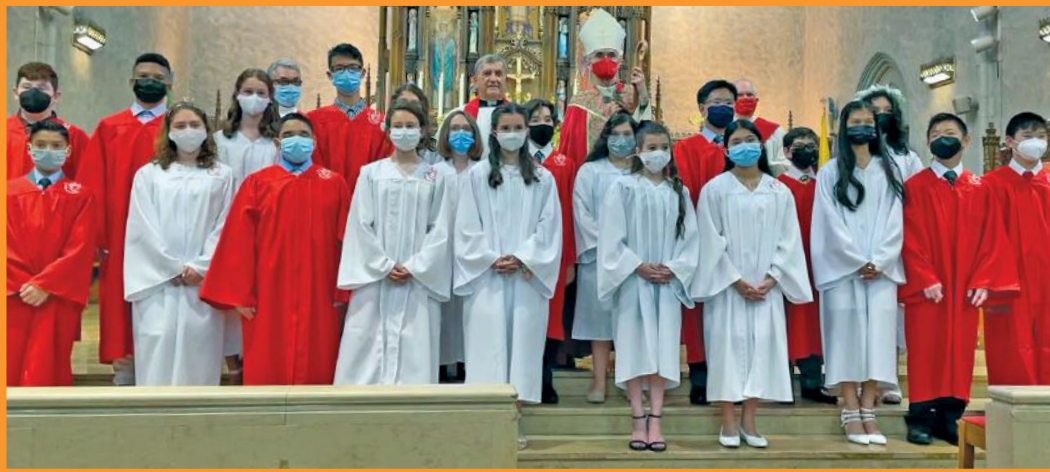
Pictured—Student confirmands from Religious Education (top) and from the OLQM Catholic Academy (left).