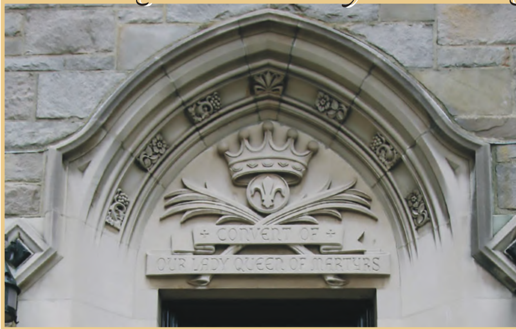
During major church repairs, the convent building is home for Daily Mass.