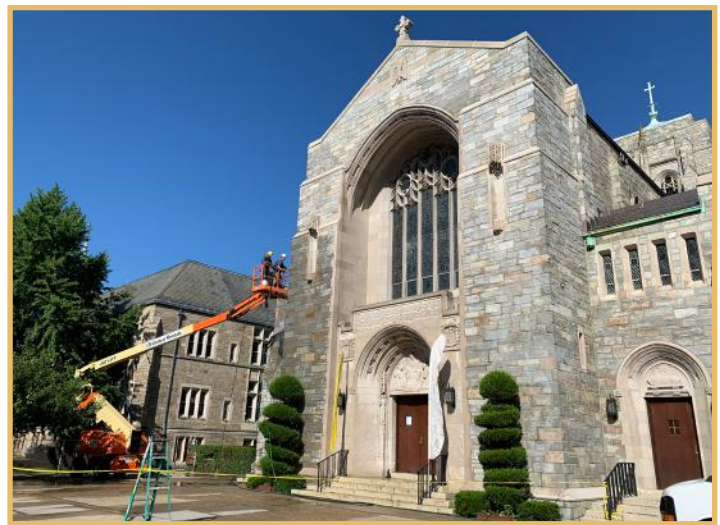
Above—The church floor: before and after cleaning. Right, top—With the back of the church completed, the pews are now moved to make way for work to begin on the floor at the front of the church. Right, bottom—The power washing of the church exterior is completed.

FOR THE WELL-BEING OF EVERYONE: When attending Mass, please abide by these guidelines: Wear a face mask (required). Bring your own hand sanitizer or wear gloves. Use the bathroom at home before coming to Mass. Arrive 20 minutes before Mass start time. Use the designated entrance only. Remain six feet apart. Follow the instructions of the ushers on seating in the hall, Communion distribution, and exiting the hall. If you are sick, please continue to pray in the privacy of your home and watch Sunday Mass on our website. Thank you for your cooperation.