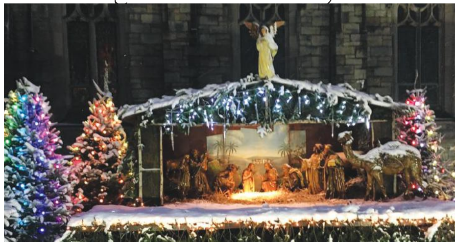
From the bulletin archives, December 2017