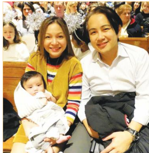
Please visit www.ourladyqueenofmartyrs.org/photo-gallery for additional pictures.