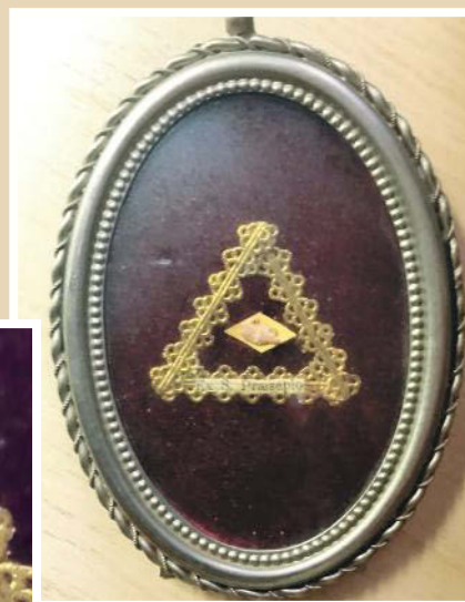
Detail of relic Ex S. Praesepio, containing a piece of the Holy Crib of Jesus Christ