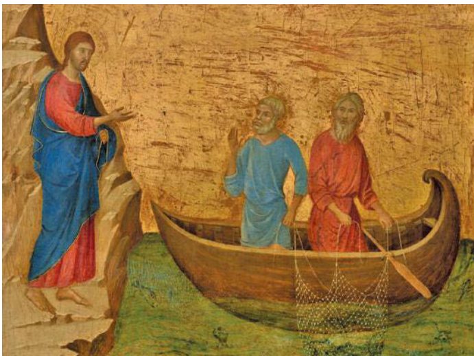
The Calling of the Apostles Peter and Andrew by Duccio di Buoninsegna Painter, c. 1250-1318, National Gallery of Art

And it is a prayer we should offer every week.