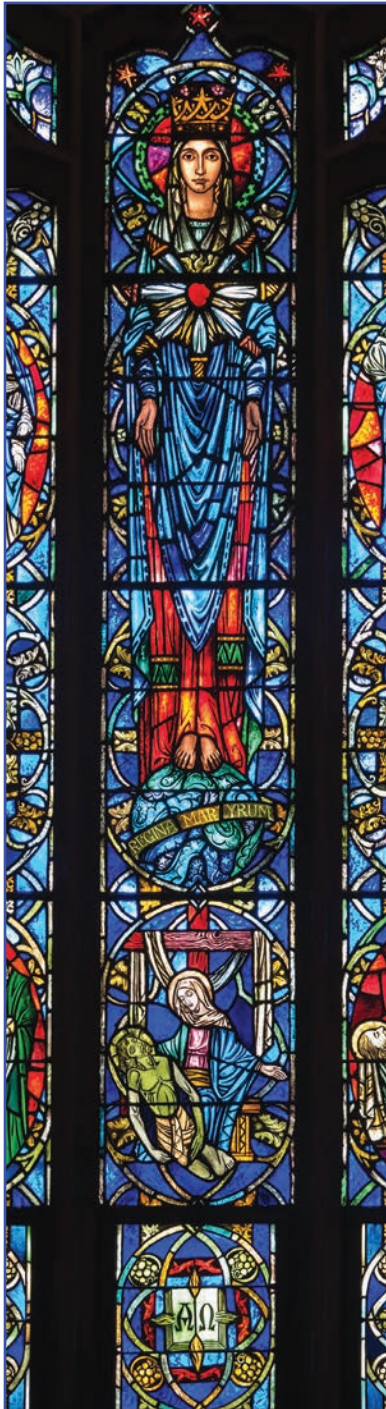
Detail of the choir loft Mary window. The central figure of this expansive stained glass window is that of the Queen of Martyrs (Regina Martyrum). The smaller stained glass panels represent different episodes in the life of the Blessed Mother.

September 2020 through August 2021 (with comparison to previous financial year)