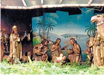
Outdoor creche on Christmas Eve

Photos courtesy of LeeAnn Close, Denise DeMaria, Regina Faighes, Deacon Greg Kandra, Andy Nguyen, and Leon Volskis. (Each contributor is credited with their initials.) View the full photo gallery at ourladyqueenofmartyrs.org/christmas-2020-in-pictures .