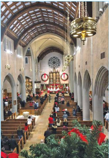
Christmas Eve Mass, choir loft view (L.C.)