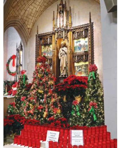
St. Joseph altar (L.V.)