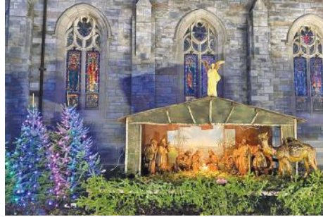
Outdoor creche at night (R.F.)