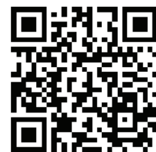
Join OLMQ on Hallow