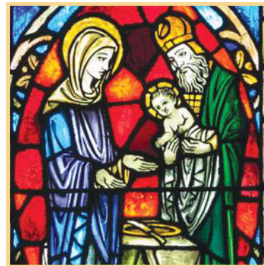
Presentation of the Lord, detail from the Mary window in the choir loft

St. Blaise is invoked on behalf of the sick as the patron saint of throat ailments. We will offer a communal blessing at the end of the Masses for healing and protection against throat diseases and other maladies.