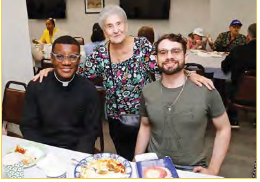
Socializing at the annual summer potluck luncheon