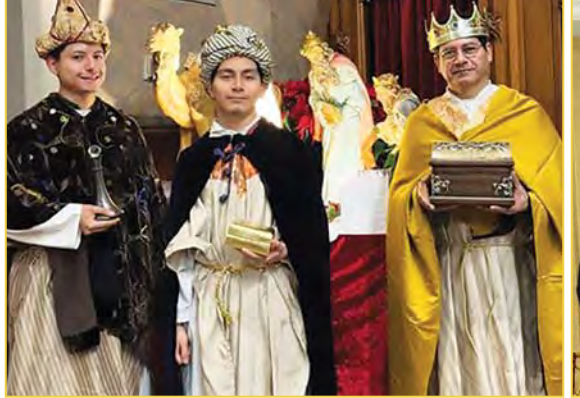
The Three Kings tradition always welcomes the year