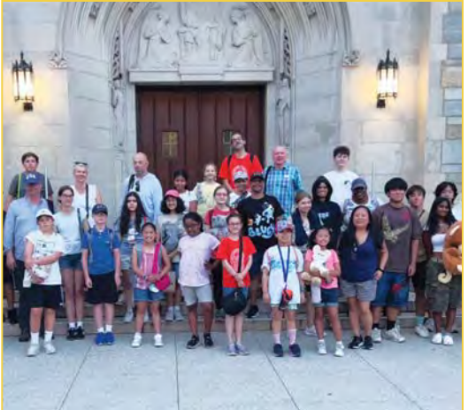
Altar server appreciation day