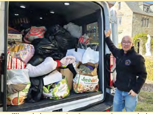
Through the generosity of so many of you, we had successful food, clothing & toy drives, supporting Catholic Charities and reaching those in need

Thank you for being part of our parish family and for all the ways that you contribute to making Our Lady Queen of Martyrs so special. God bless you.