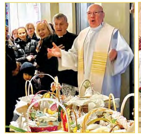
A new tradition: blessing of Easter baskets