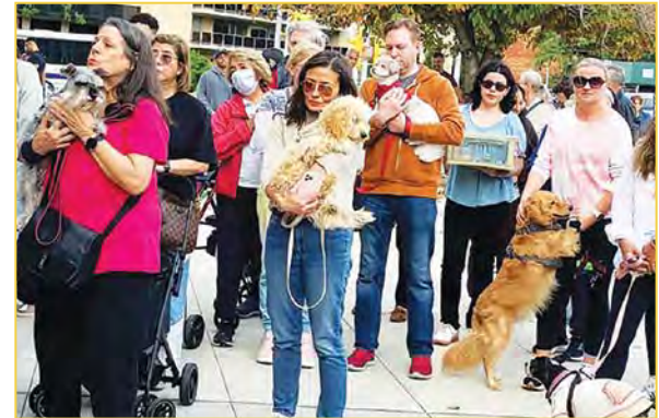
A beloved event each fall: the blessing of animals