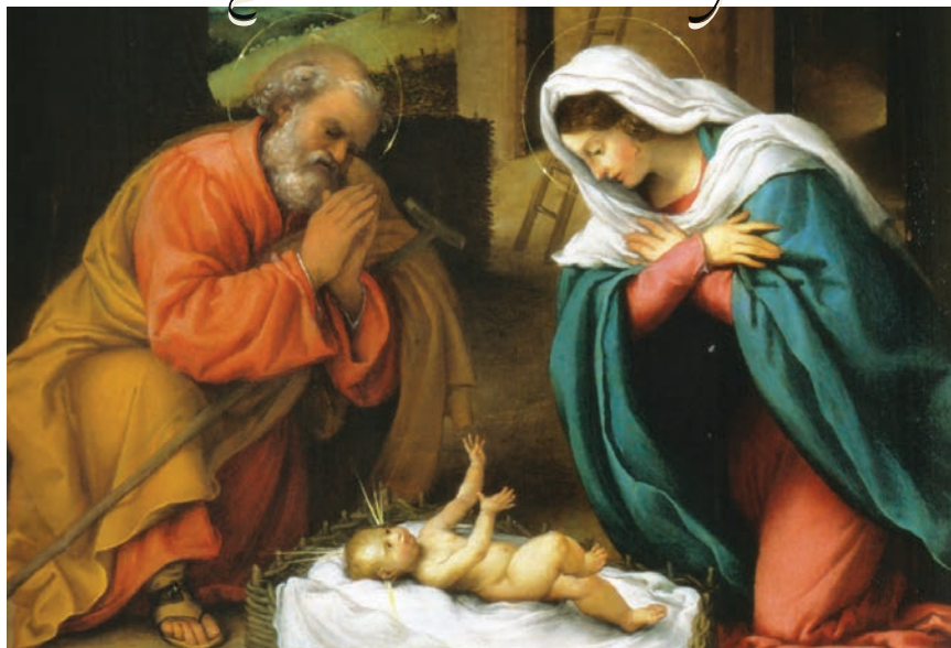
The Nativity by Lorenzo Lotto, 1523