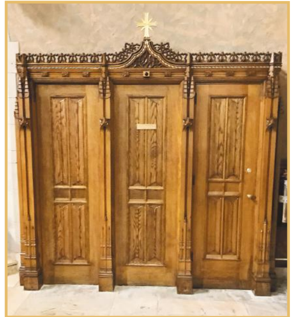
Enhanced confessional exterior. The interiors were refreshed with paint and new carpet.

DAILY MASSES WILL MOVE TO THE RENOVATED CHURCH STARTING MONDAY, AUGUST 24 AT 8 A.M. AND 12:05 P.M.