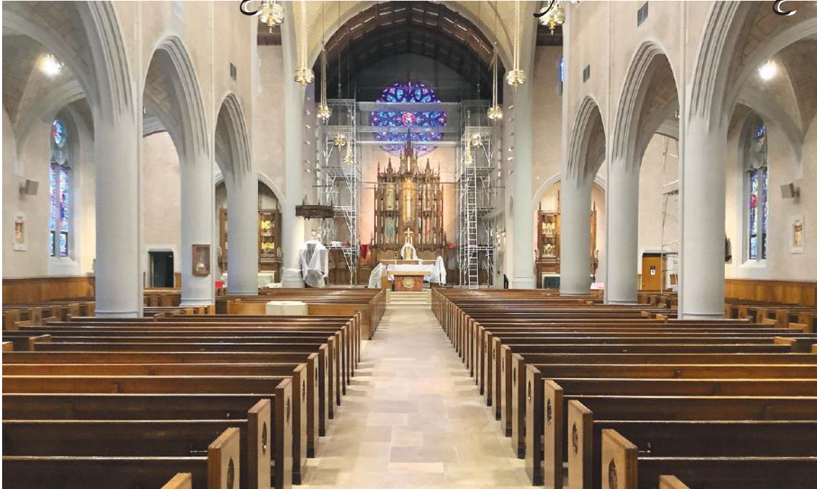
Our restored nave with new lighting, clean floors, and new kneelers