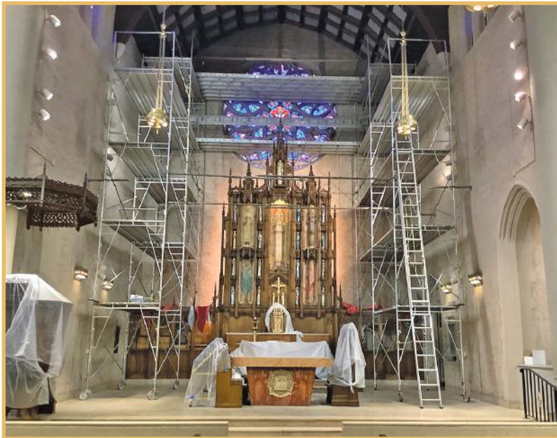
The sanctuary under restoration.

May God, through the intercession of Mary under her title as "the Queen of Martyrs," continue his blessing upon us.