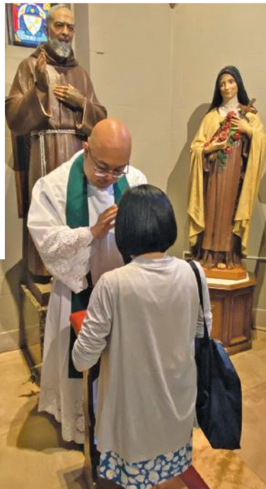
Visit the photo gallery section of our website for more pictures.