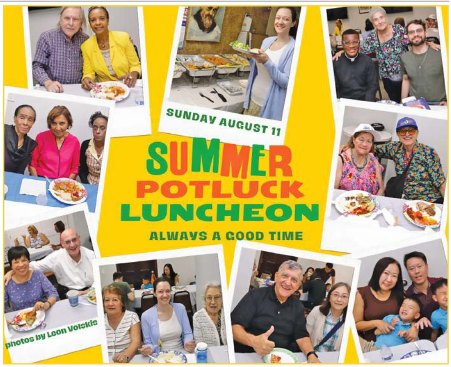
Many thanks to our Pastoral Care group and everyone who came to our church potluck luncheon earlier this month.

Early Bulletin Deadline for Labor Day. The deadline for the bulletin of September 8 is Thursday, August 29. If your church group requires a news announcement, please submit your material to olqmcomm@olqmchurch.org. All announcements are subject to approval.