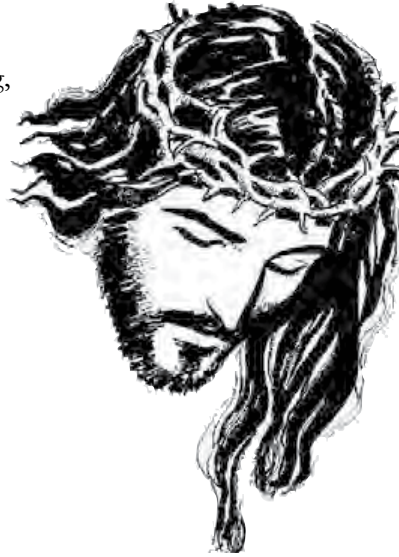
Jesus, remember me when you come into your kingdom.

VII. Bruised, derided, cursed, defiled, She beheld her tender Child, All with bloody scourges rent.