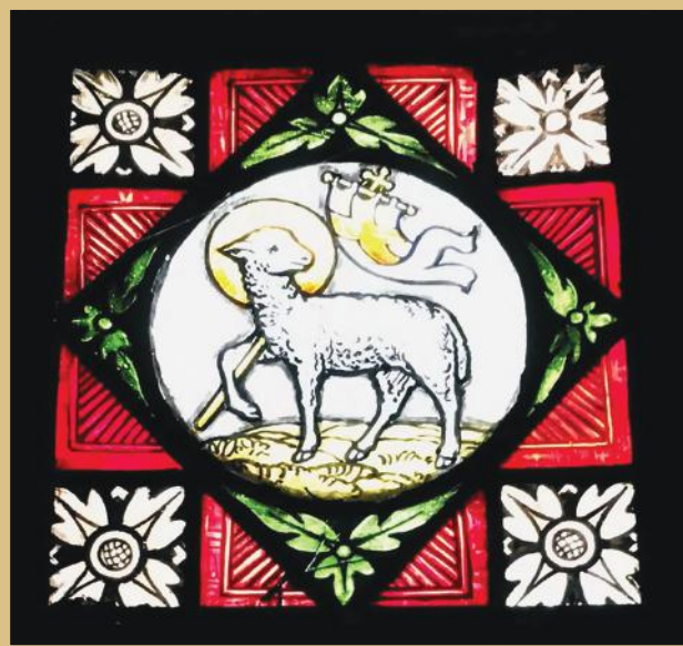
LAMB OF GOD— The lamb is a powerful Easter symbol. One of the hidden treasures within our church is this small stained glass window. Do you know where it is located?