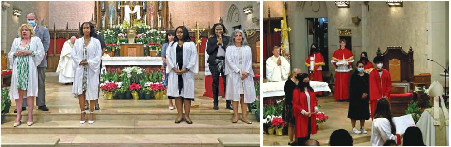
Pictured—Welcome to our faith community! (left) The Elect and newly baptized of our RCIA program, clothed in white robes; (right) the Candidates who received Confirmation and Eucharist. During the Easter Vigil, the entire congregation renewed their baptismal promises.