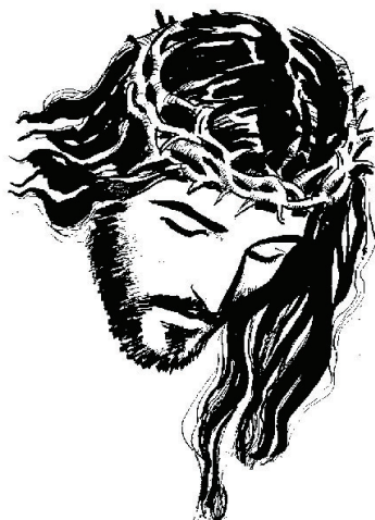
Jesus, remember me when you come into your kingdom.

VII. Bruised, derided, cursed, defiled, She beheld her tender Child, All with bloody scourges rent.