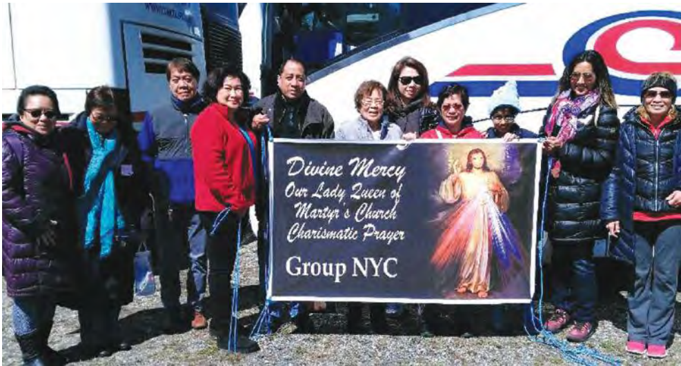
Recent Happening—The Charismatic Prayer Group from OLQM took a bus pilgrimage to the famed National Shrine of the Divine Mercy on April 23. Stay tuned for news of the group's next pilgrimage.