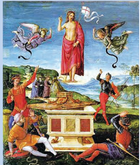
The Resurrection of Christ , by Raphael (1502) São Paulo Museum of Art

Each of these accounts gives us reason to rejoice and reminds us that the great miracle of Easter continues within each of us, as we seek to live out its meaning, as people of the Resurrection. Have a blessed and joyful Easter!