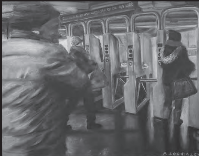
DRAWING BY YESORA SONG WINDSOR ART STUDENT

Wedding Invitations & Holiday Cards Log Onto www.jpcc.net conveniently from your home or office. ONLINE CATALOG • ONLINE ORDERING • ONLINE PROOFING All Major Credit Cards Accepted FREE UPS GROUND SHIPPING!