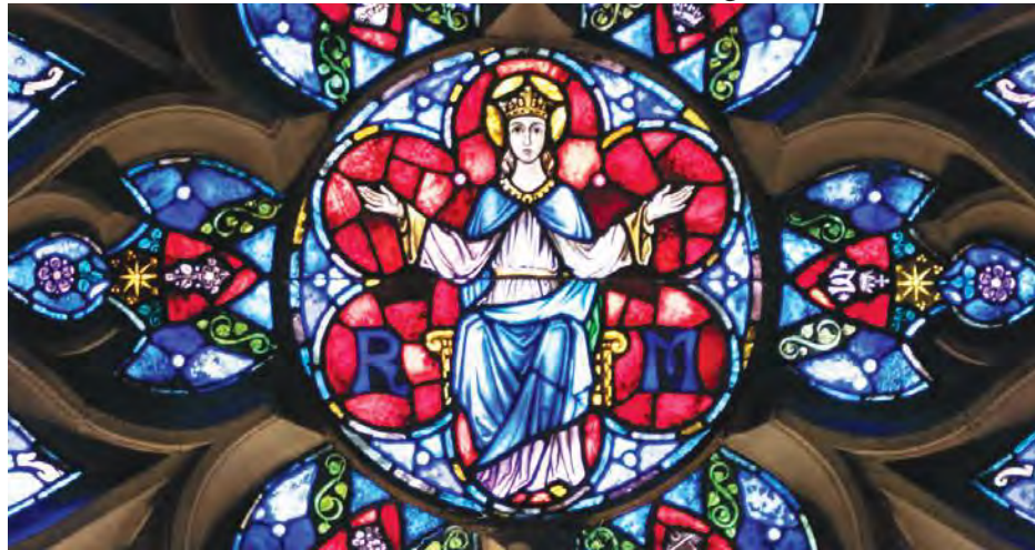
Mary, Queen of Martyrs.