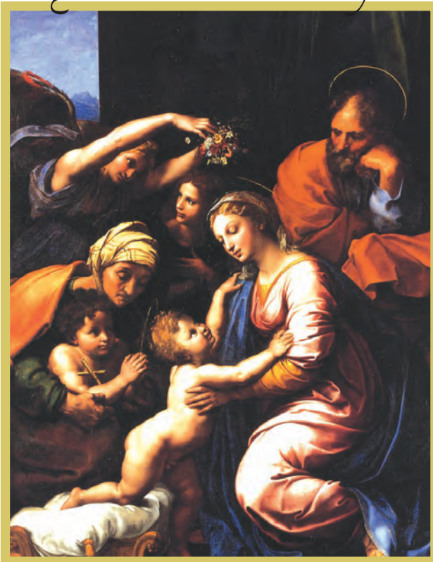
The Holy Family by Raphael (1518) with Saint Elisabeth and infant John the Baptist