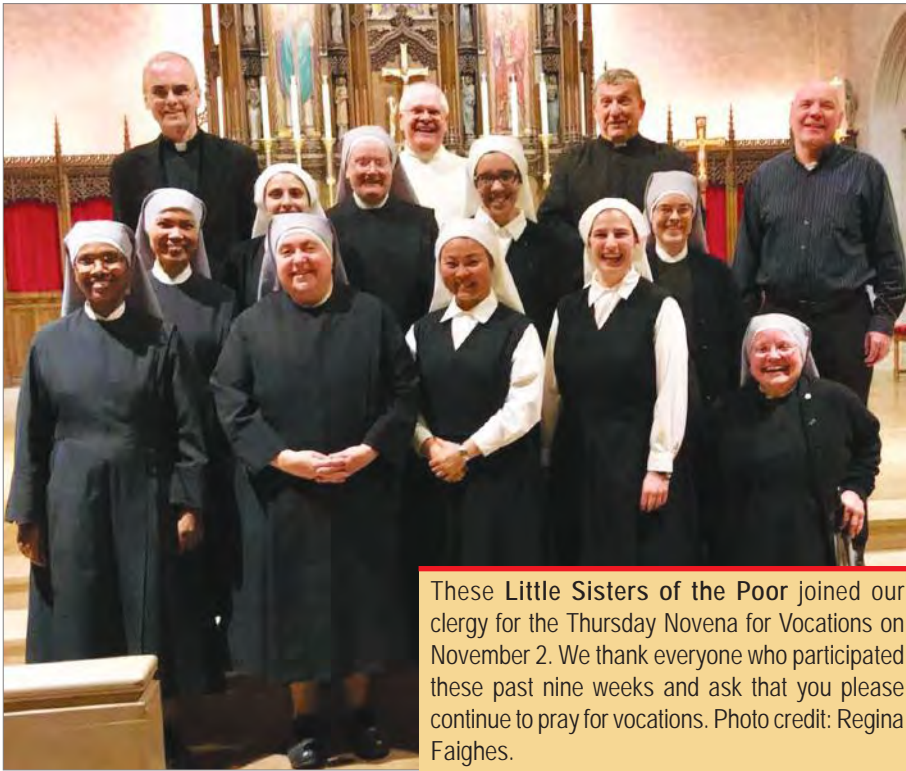
These Little Sisters of the Poor joined our clergy for the Thursday Novena for Vocations on November 2. We thank everyone who participated these past nine weeks and ask that you please continue to pray for vocations.