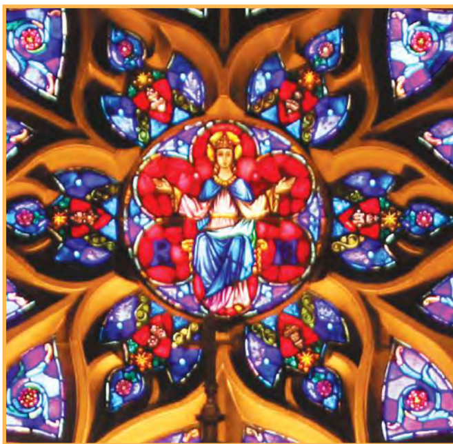
Detail of the chancel rose window with Our Lady Queen of Martyrs

Visit ourladyqueenofmartyrs.org/our-church-history ; there, click on "Our Beautiful Church: A Pictorial History," for more about our church building and architecture.