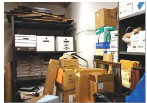
Before (above) and after (below): taming a paper jungle