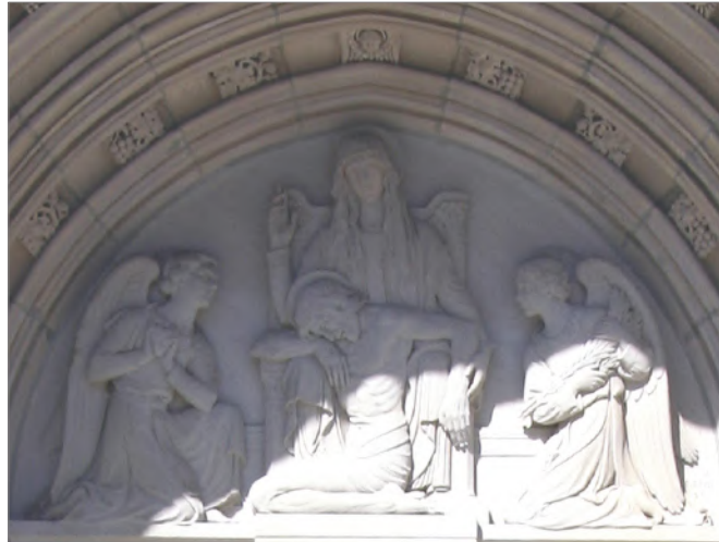
The traditional pieta above the main entranceway

Over the door to the left of the main portal (as one faces the church) is carved the Sacrifice of the New Law. Christ is represented by the New Testament Paschal Lamb by whose death we are saved from our sins. Over