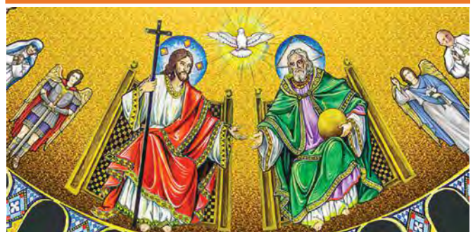
Detail from the Trinity Dome mosaic, Basilica of the National Shrine of the Immaculate Conception, Washington, DC