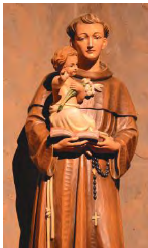
Familiar to many of you: the statue of St. Anthony in our church

Join us at our 12:05 p.m. Mass on June 13, when we observe St. Anthony's Feast Day and conclude our Novena.