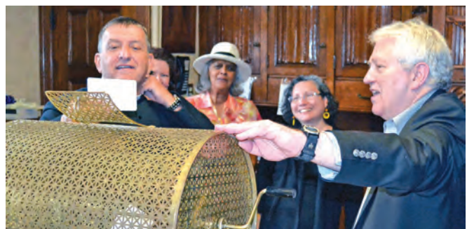
407-Our Lady Queen of Martyrs