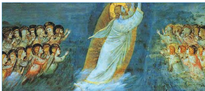
Giotto's Ascension, Scrovegni Chapel, Padua, Italy, ca. 1300

» Please use the blue envelope at any time to contribute to the Parish Endowment Fund or, at our Parish Giving portal, select Blue Envelope from the pull-down menu. More at ourladyqueenofmartyrs.org/blue-envelope .