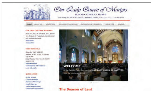
ourladyqueenofmartyrs.org same address, new look

We've Launched a Website Redesign—effective April 2, 2014. The site has an updated look that we hope will be visually appealing and easy to navigate. It also has a mobile version for those who access the web with a smart-phone. Regular site visitors can find the current week's bulletin for download under QUICK LINKS on the left column of the front page. On a smartphone, using the three-line navicon (≡) you'll have access to the full site menu and can find the bulletin under About Us. In the months ahead, the site will expand in content and function as we strive to make improvements and make the website a primary way for regular and new visitors to stay informed about our parish.