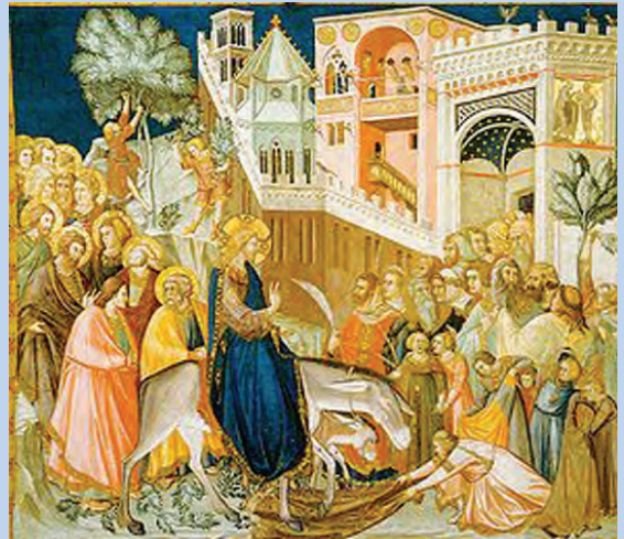
Entry of Christ into Jerusalem (1320) by Pietro Lorenzetti, San Francesco, Assisi, Italy

The Passion story is so familiar to us. But this year, listen to it with new ears, experience it with a new heart. And ask yourself: How am I like the mob shouting "Crucify him"? How am I like Peter, denying him? How am I like one of the many who waved palms saluting Jesus, only to turn against him when things became too difficult? If you haven't been able to pray the Stations of the Cross this Lent, take this opportunity to imagine you are walking them during the Gospel narrative. The palms we hold and the words we speak transport us back two thousand years, and make The Passion immediate, and real. It should be that way at every Mass, at every Eucharist. Listen, watch and pray, and let us begin together the anxious waiting of this tragic week—waiting for the miracle that will finally free us all.